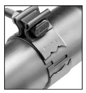
AccuSeal, with Torca designed slots, provides optimal seal and joint retention performance.